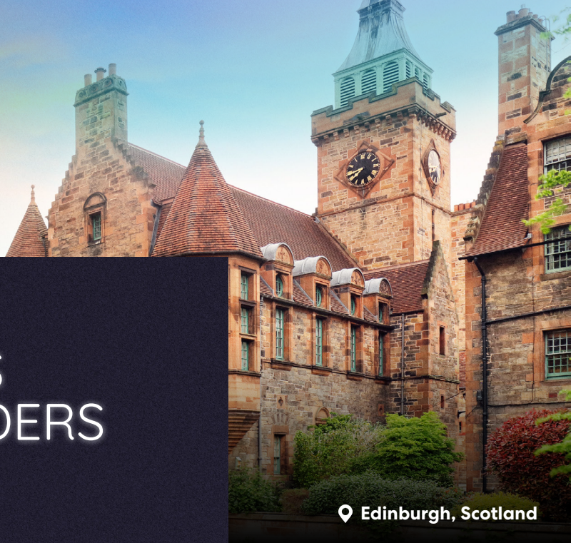
📍 Edinburgh, Scotland